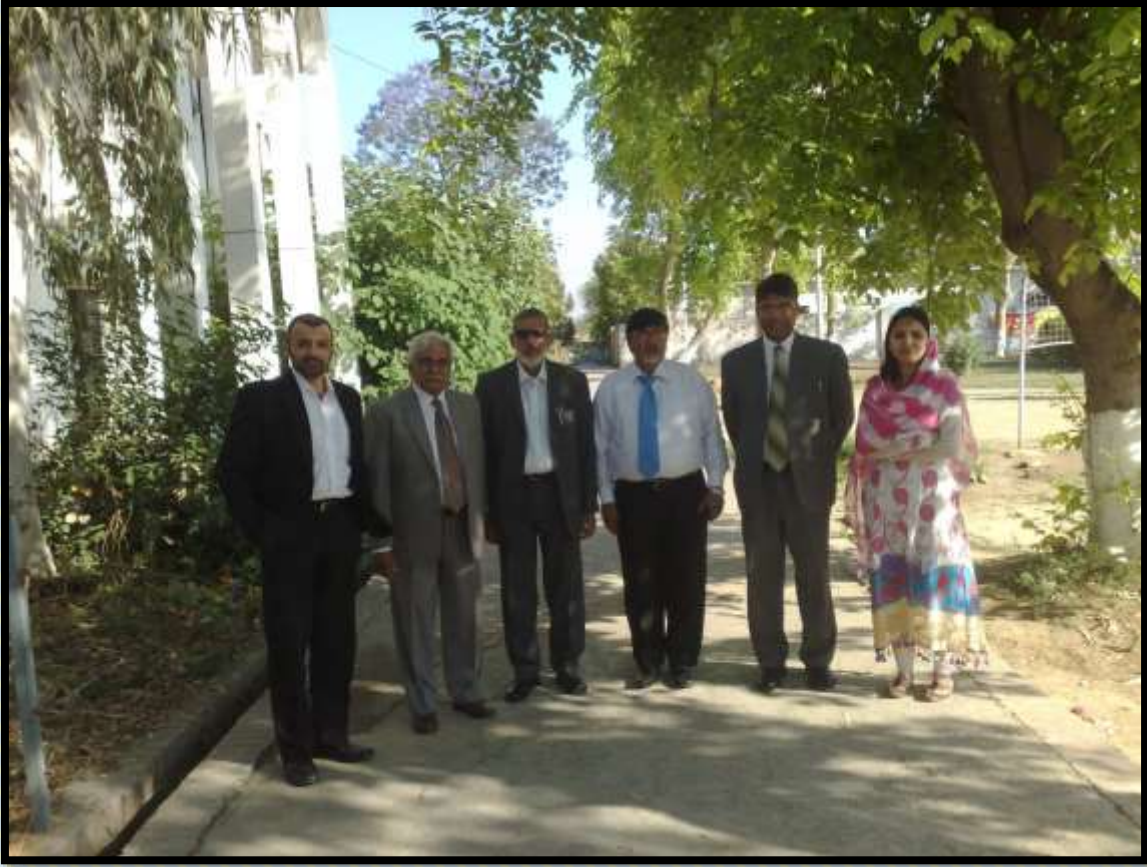
AIC Visit Riphah International University- Islamabad