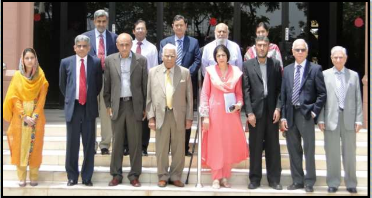
AIC Visit at Institute of Business Management- Karachi