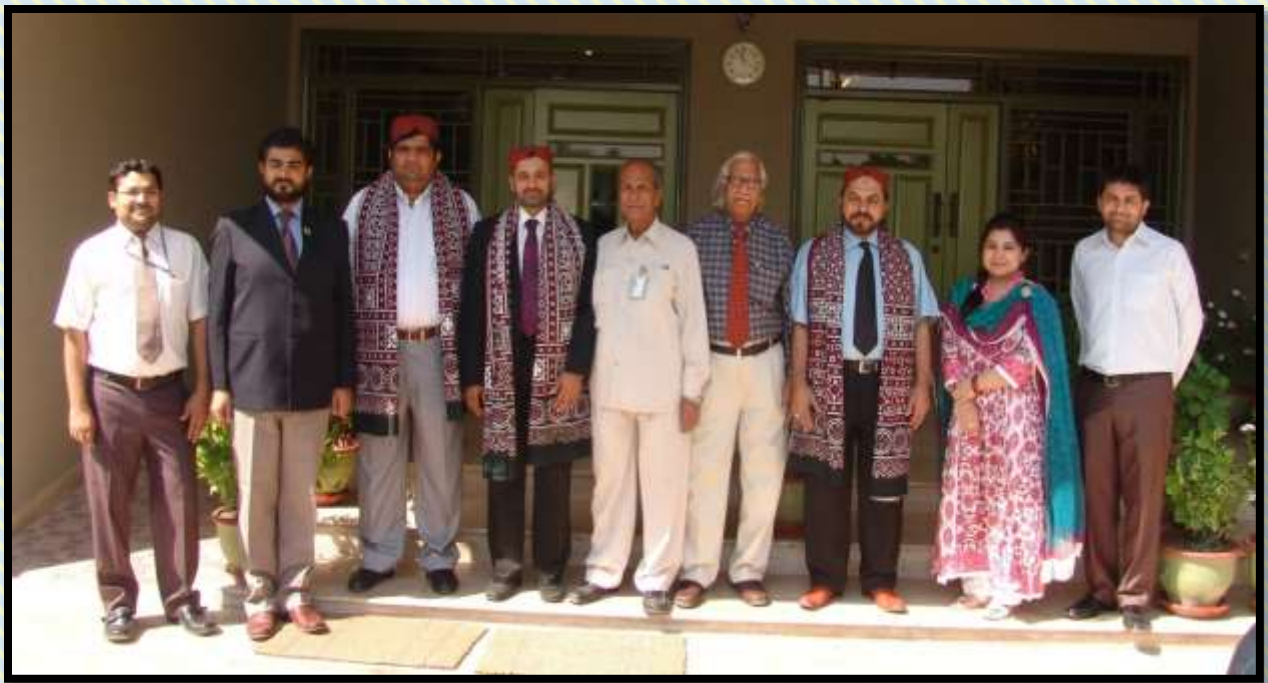
AIC Visit at ISRA University- Hyderabad

During the year 2012-13 NBEAC announced completion of the pilot phase of accreditation of institutions offering business education in Pakistan. Eleven business schools have been granted accreditation. The total number of business schools applied for accreditation is forty eight.